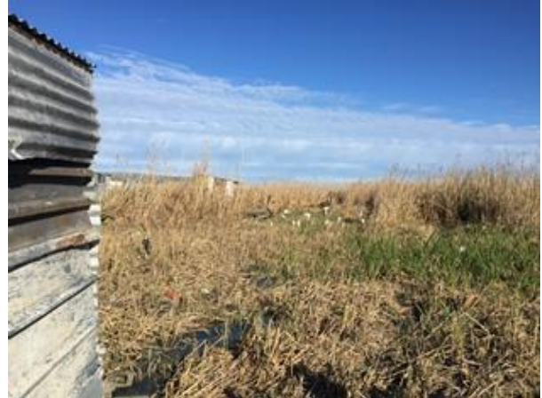
Typical views of the fringe conditions at the interface between wetland and housing structures