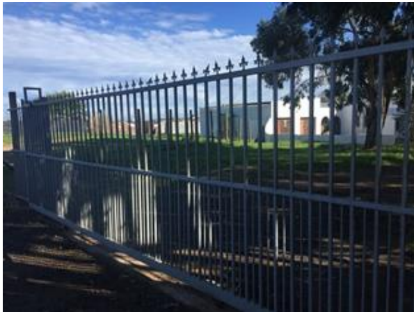
Properties at the end of Lekkerwater Road