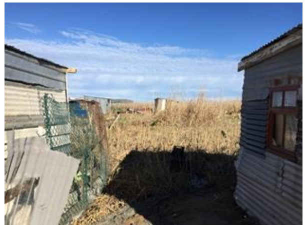
Typical views of the fringe conditions at the interface between wetland and housing structures