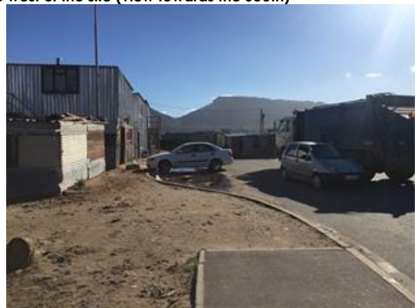
Existing portion of Houmoed Avenue in the west of the site (view towards the North)