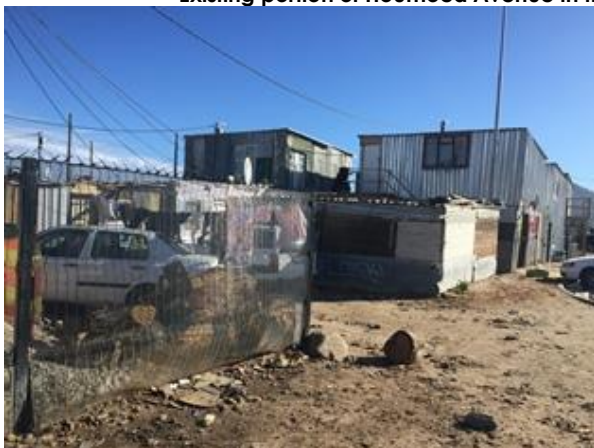
View towards the west of the existing portion of Houmoed Avenue – i.e. off the site to the west