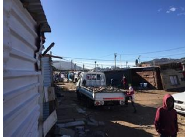
Typical views of the infilled and thoroughly compacted wetland areas where temporary housing structures have been established.