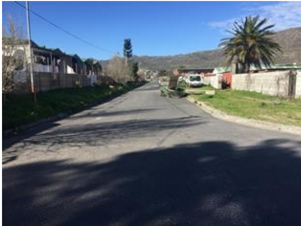
View down Lekkerwater Road, taken from northern most point, looking south