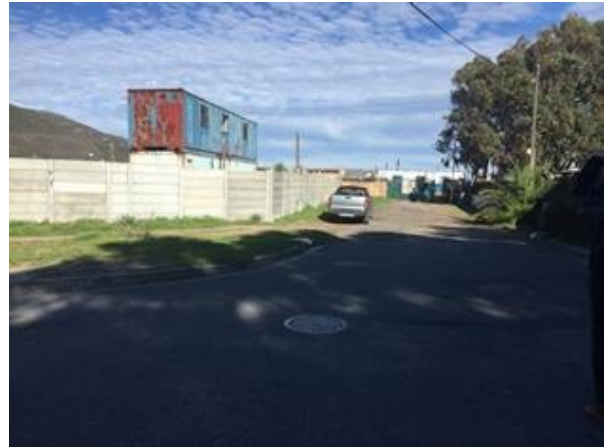
View towards west taken from northern most point along Lekkerwater Road