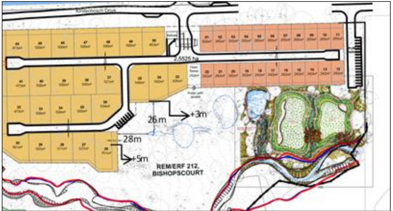
Figure 3 Proposed development layout reflecting implementation of recommended buffers from the spring