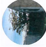
Large tree with thick trunk, dense foliage, 17m tall, 17cm dbh.