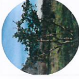
Large tree with thick trunk, dense foliage, 15m tall, 15cm dbh.