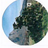
Large tree with thick trunk, dense foliage, 18m tall, 18cm dbh.