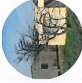
Large tree with thick trunk, dense foliage, 16m tall, 16cm dbh.