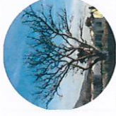
Large tree with thick trunk, sparse branches, 10m tall, 10cm dbh.