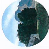
Large tree with thick trunk, dense foliage, 14m tall, 14cm dbh.