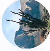
Large tree with thick trunk, dense foliage, 13m tall, 13cm dbh.