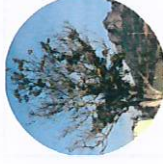
Large tree with thick trunk, dense foliage, 12m tall, 12cm dbh.