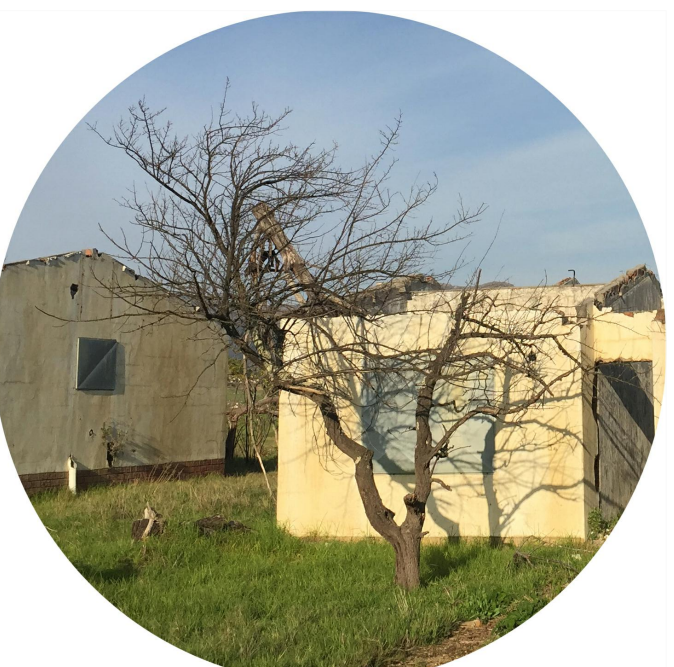
An example of dead tree to be felled.