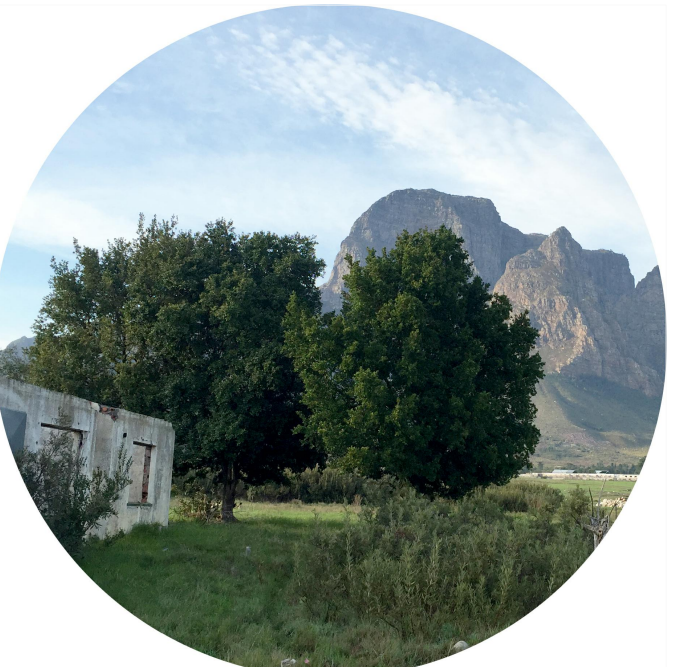
3 x existing Brongium porculorum are large mature trees, seen from the entrance driveway, to be retained (trees 2, 3, 4).