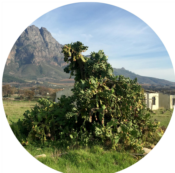
Opuntia humifusa to be removed (tree 31).