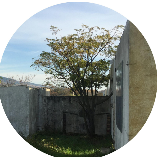
Trees, which grew inside or too close to the existing cottages, are to be felled.

This drawing must not be scaled. Dimensions and finished levels indicated may only be used. All levels, dimensions and specifications are to be verified on site and checked against the drawings prior to commencement of any works. Any discrepancies must be reported to the landscape architect.