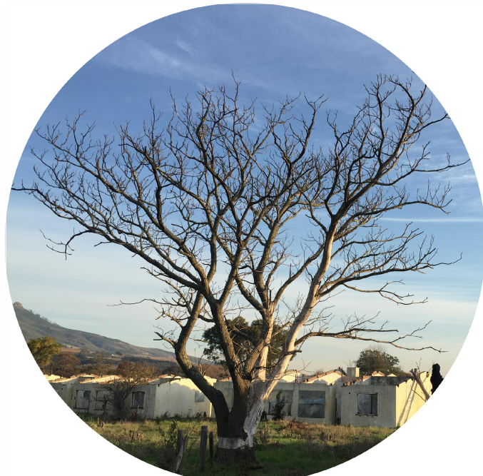
Existing dead tree to be retained, to be made safe, to later detail (tree 5).