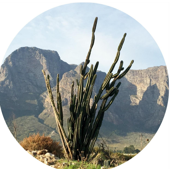
Existing cactus to be removed (tree 9).