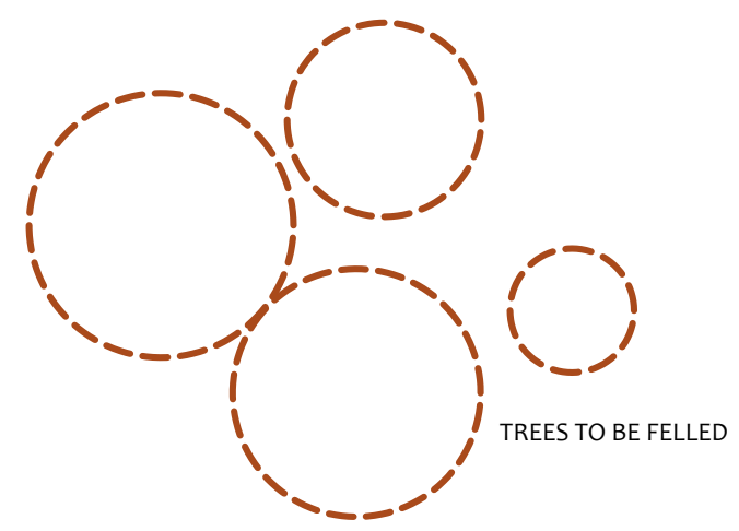
TREES TO BE FELLED

Trees are of an immense environmental and aesthetic value. This drawing is a baseline layout of the existing trees in order to describe the surveyed on site tree species. It indicates existing significant trees that are to be retained and protected, and it assists in development of management strategy and of proposal of future tree and other planting.