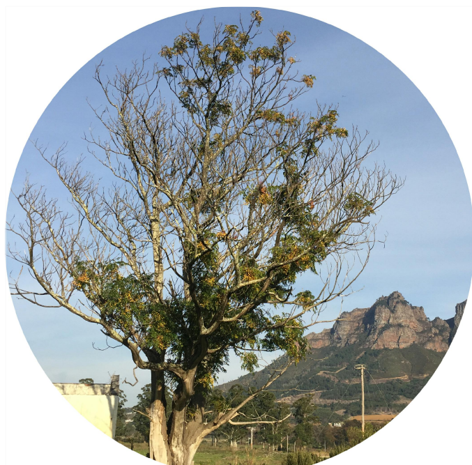
All Melia azadirach trees are to be felled.

Tree Management During Construction Stage Tree Pruning and Health Monitoring Methodology