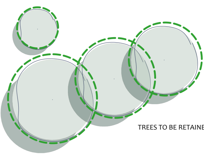
TREES TO BE RETAINED