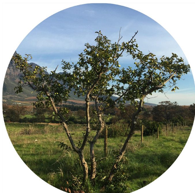
Single Psidium guajava to be retained (tree 27).