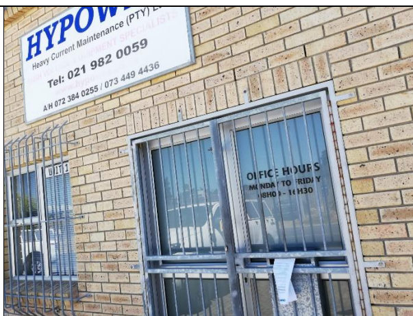
Figure 6 Letters placed in post box near the site (3)