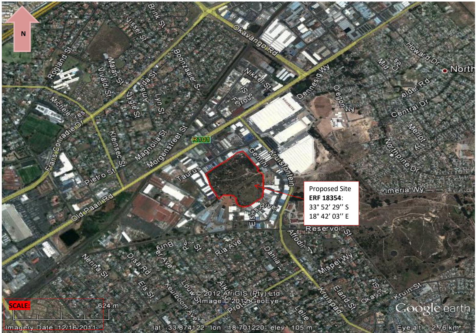
Figure 1: Locality map of the proposed site in Brackenfell